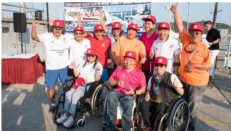
Winners – 2017 24 Hour Charity Dinghy Race

Other achievements included winning the HHYC 24 Hour Charity Dingy Race for the second time and also gaining 4 th & 6 th places for our 2 other team entries. Given this race is open to all, it is pleasing to note that disabled sailors can win and that sailing provides an almost level playing field for competition. As 'icing on the cake', 2 of our Volunteers were voted as winners of the '24 Hour Charity Dinghy Race Volunteers' Trophy