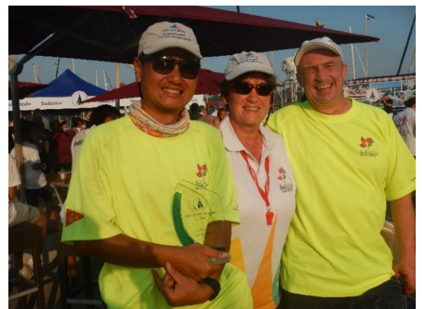
Volunteer Trophy Winners