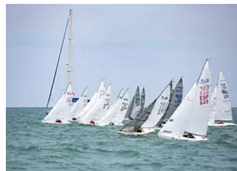
Step 2 2.4mRs 2014