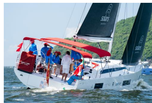
Step 3 MoHan 2022