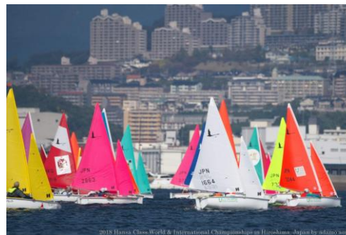
Step 1 Hansas 2010