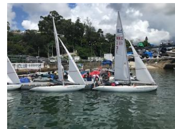
2.4mR Technical Paralympic boat