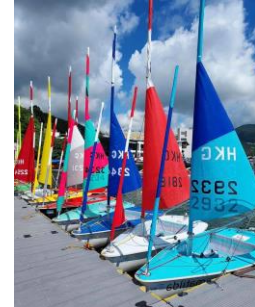
Hansa 2.3 and 303